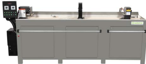
ADH-2045 Long Frame Unit