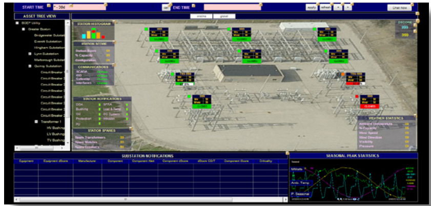
dobleARMS™ offers traditional one-line and geospatial views of asset condition within the substation with links to drill down to asset views.