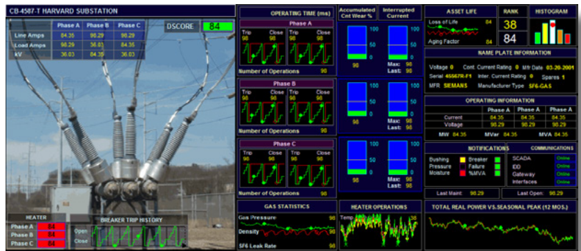
dobleARMS™ seamlessly integrates data from multiple sources and presents alerts and notifications in a consolidated data view.