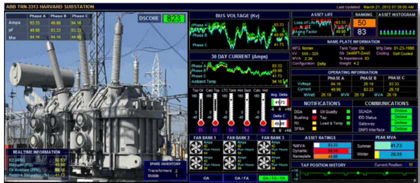
Alerts and notifications are summarized in dynamic views of transformer health with links to component details such as DGA and bushings.